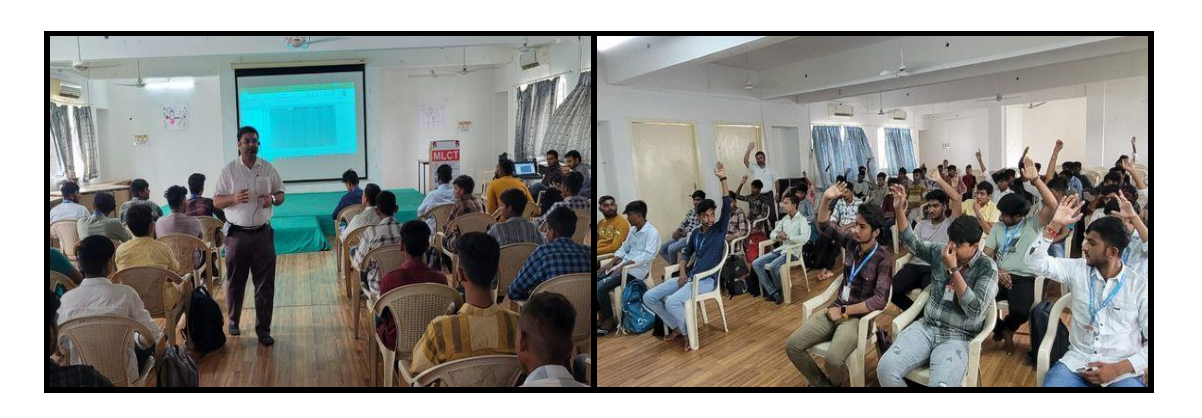
Session: 4: Recent Innovations in Civil Construction Engineering