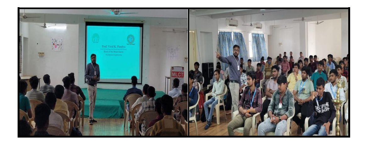
Session: 3: Introduction to MINITAB