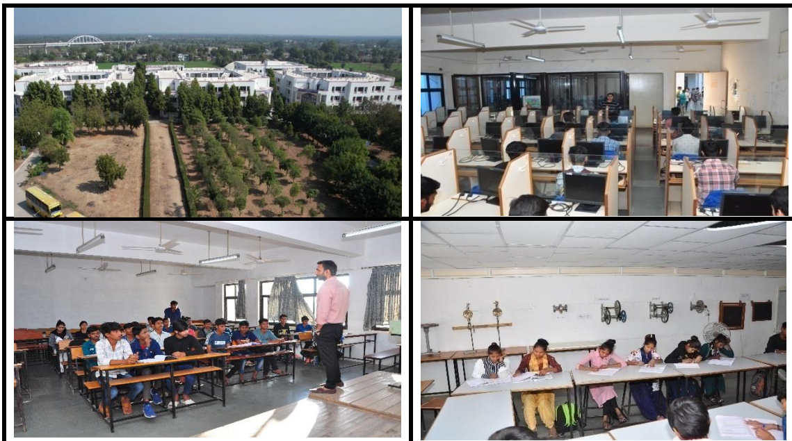
Modern Laboratories & Workshops